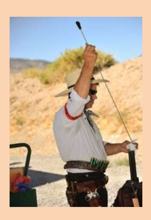
"Goddamn squib, I have to start putting a little more than 1 gram of powder in my loads."