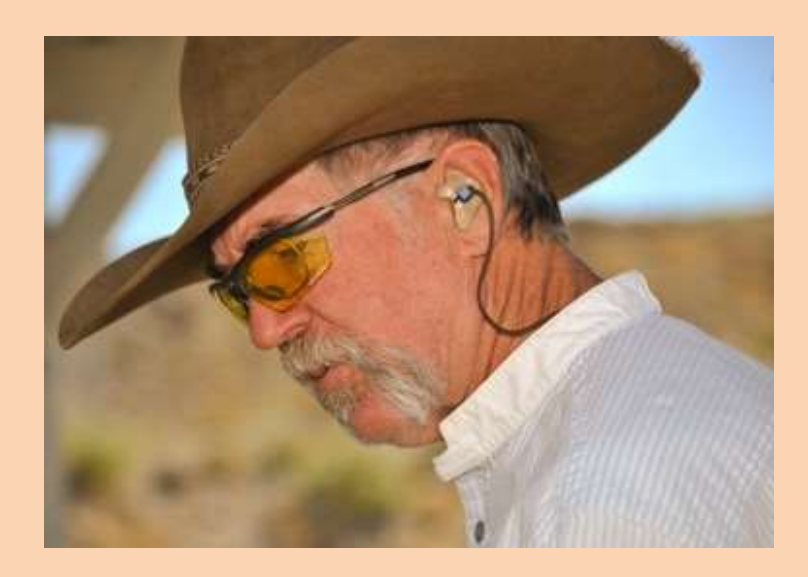
"I know I shot that stage in the right order...."